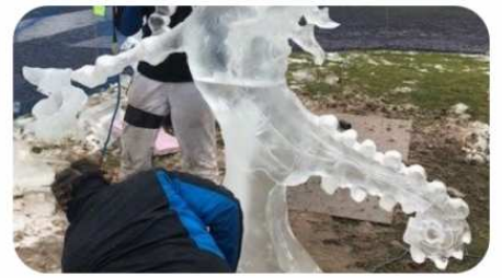
Oregon Coast Culinary Institute's Ice Team Takes Home Gold

41 Certified Culinarian / Pastry Culinarian