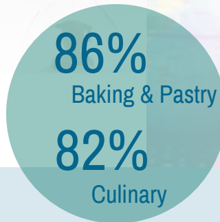
Placement Rate** 2017 & 2018 Cohort