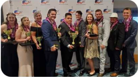
OCCI Student Team Wins ACF National Championship