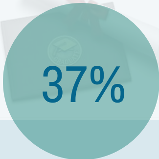
Culinary Arts Graduation Rate