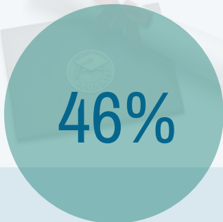
Culinary Arts Graduation Rate