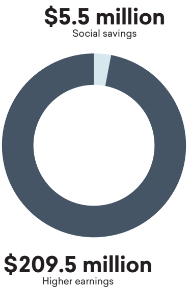
FIGURE 3: Present value of higher earnings and social savings in Oregon